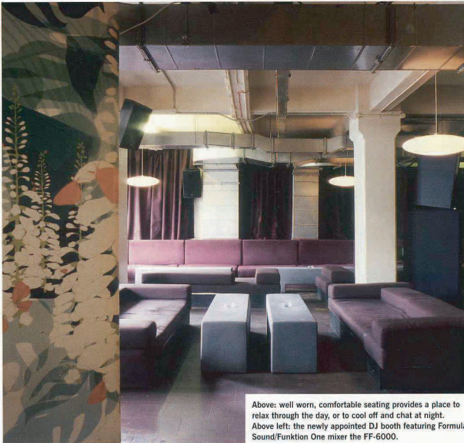
Above: well worn, comfortable seating provides a place to relax through the day, or to cool off and chat at night. Above left: the newly appointed DJ booth featuring Formula Sound/Funktion One mixer the FF-6000.

some club nights, a move which she describes as "the best thing I could have done". He established a monthly roster of residencies involving respected DJs Andrew Weatherall, Damian Lazarus and Ivan Smagge - all of whom agreed to a reduction on their usual gig fees in recognition of the value of the bar's egalitarian, all access philosophy. "We've never charged entry fees - I've don't agree with them. We could do, and I'm sure the venue would still be rammed, but we made the conscious decision not to in order to make T accessible to more people."