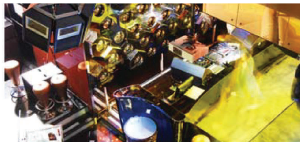
The VIP view of the DJ area