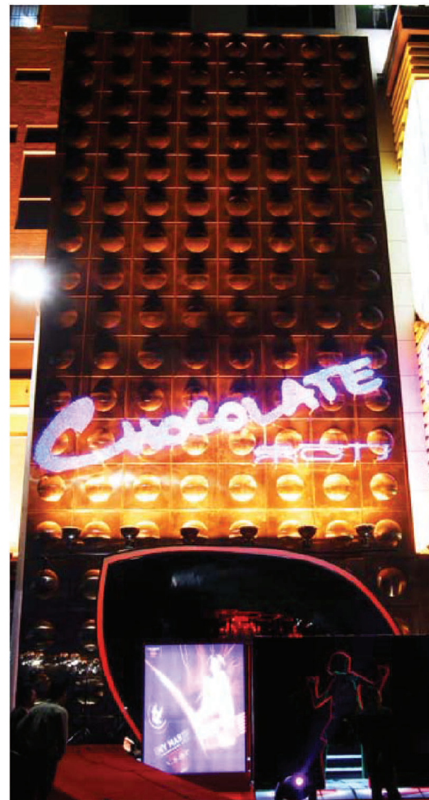
Club Chocolate entrance

The second floor contains the VIP area – a 700-sq-m reserve allowing elite customers to watch the action on the dancefloor and in the DJ