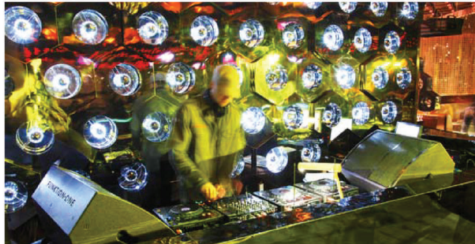
RM15 speakers in the DJ booth

booth. In this area, a further four Resolution 1 cabinets, six F88s and eight F118s have been installed. With this flexible design, the same level of high-quality music can be maintained in every corner of the club.