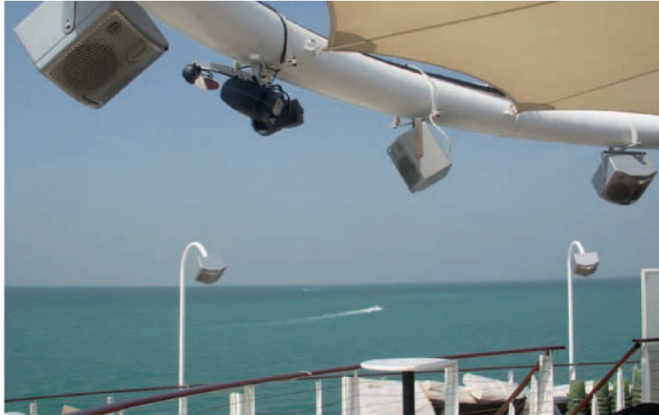
The outer ring of Funktion-One F88 cabinets angled to confine the sound to the bar area

strong audio system within 360° that wouldn't spill out of the venue's confines.