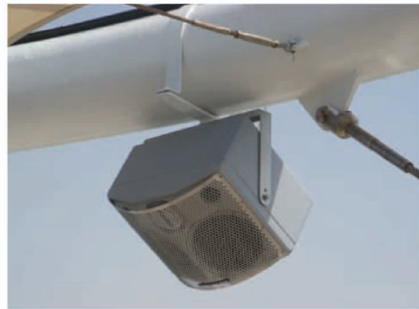
Funktion-One F88 mounting

In the end, the panic was averted regardless of Dubai traffic issues. With the outer ring of F88 speakers mounted to their poles by late Monday night, news arrived that due to uncertainty over timing