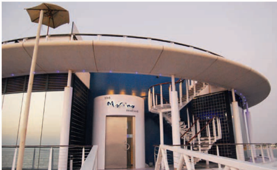
The Marina seafood restaurant, with 360 Bar above

www.ambgroupuae.com www.funktion-one.com