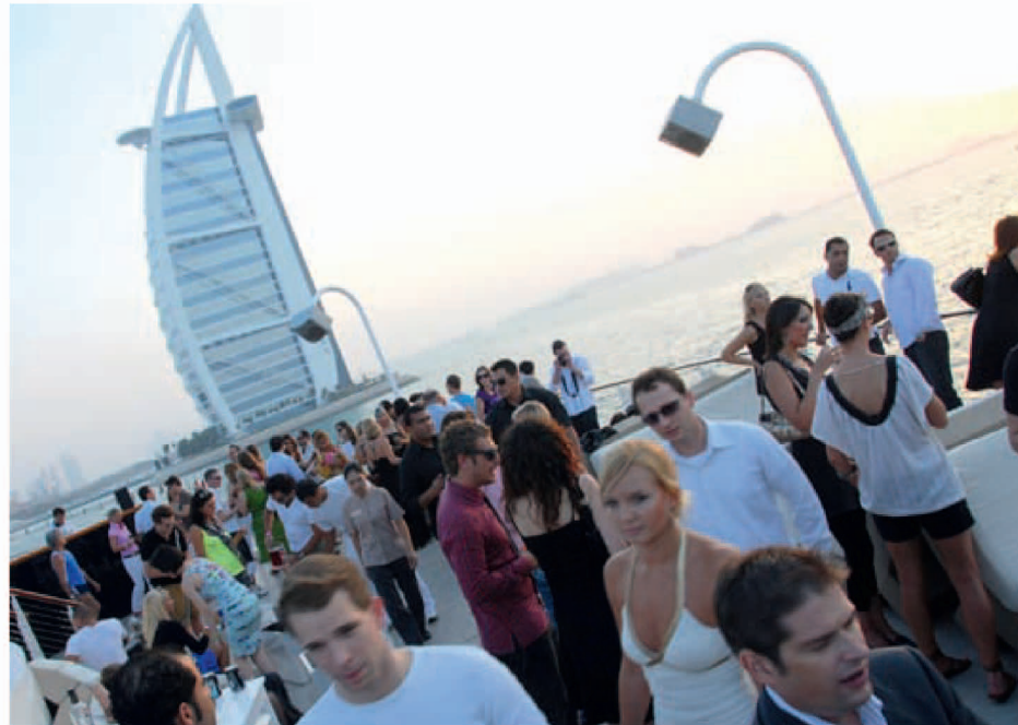
The 360 dancefloor, as the sun sets