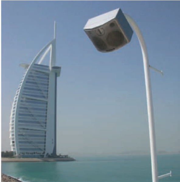
In the shadow of the Burj Dubai – one of the pole-mounted F88s