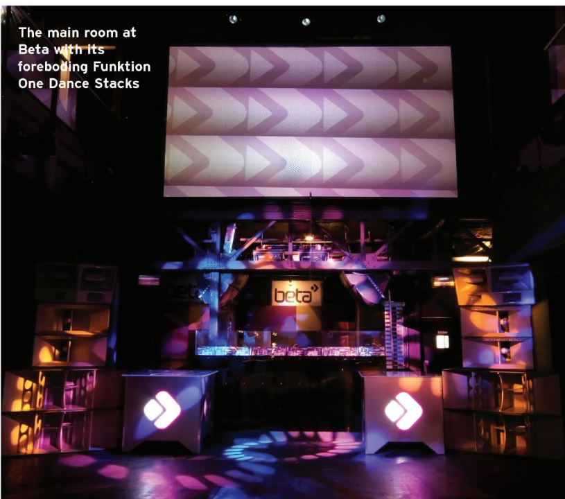
The main room at Beta with its foreboding Funktion One Dance Stacks

To complement its futuristic system, Beta has paid considerable attention to the acoustics of its venue, which, if the clubs testimony is to be believed, has paid dividends: "We've gone to great lengths to find sonic purity by hiring an acoustical engineer to analyse our space, and we've installed more acoustic paneling than Webster Hall to ensure audio perfection. Translation: our shit bumps."