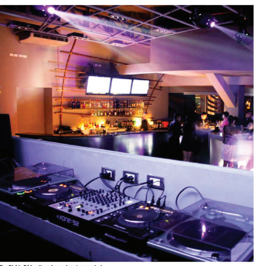
The Club's DJ booth and sound system control

Stagecraft International, Philippines: +63 91 7530 4256 www.stagecraftintl.com www.funktion-one.com