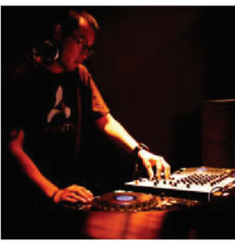
The Skye DJ booth

Mr Salvador agrees – in a recent visit to Ascend, he was pleased to see that the Dance Stacks were performing perfectly even at below optimum level. 'They are more than enough for The Club,' he says. 'They give ideal coverage to the whole room and there is a lot of headroom in the set-up – the amps are not even fully used. The beauty of the product is,