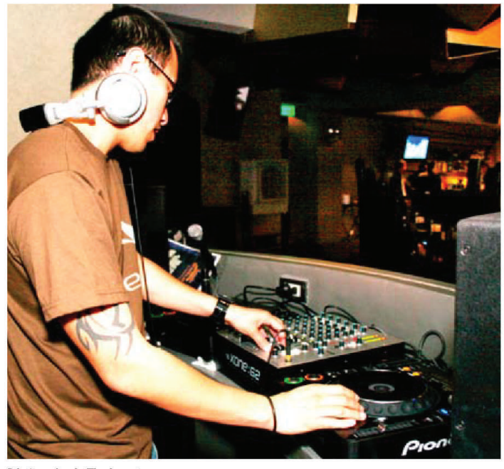
DJ at work - in The Lounge

E25 upper bass power amplifier, and two MC2 E45 LF and sub power amplifiers.