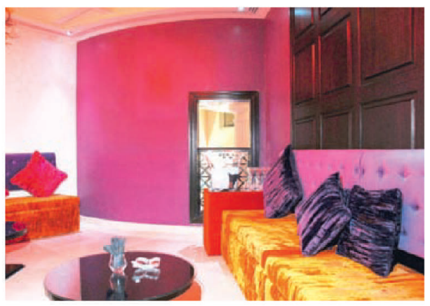
The Purple VIP room