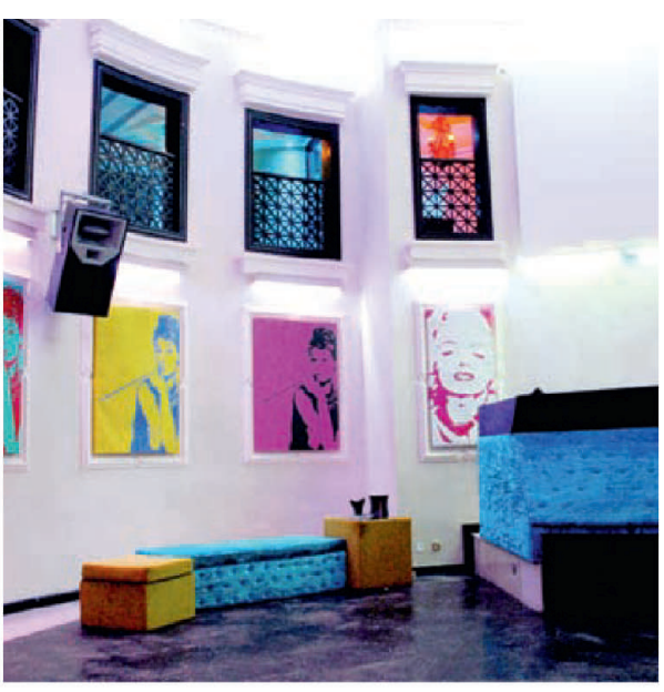
DJ island and Funktion-One Res2A loudspeaker