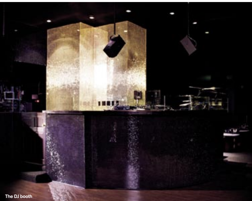
The DJ booth