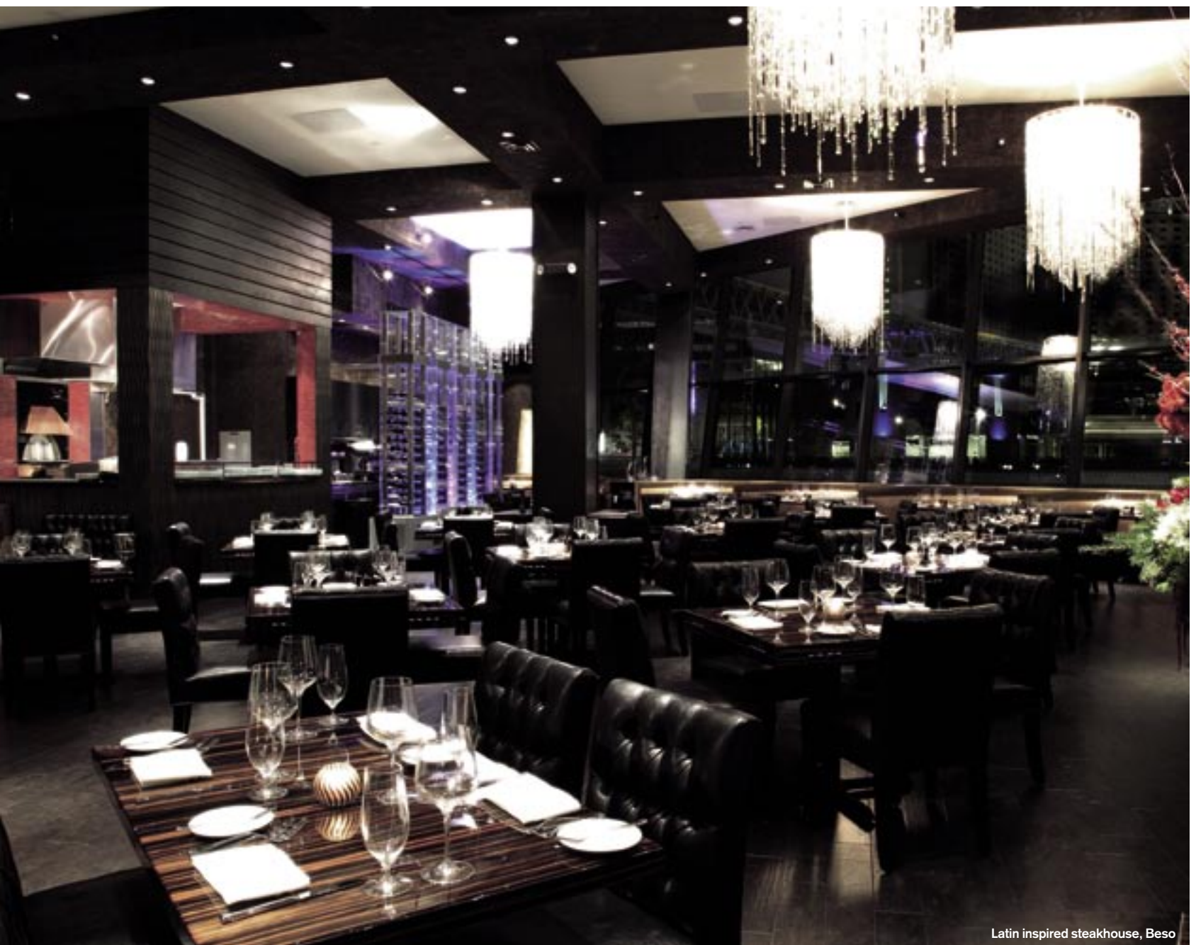
Latin inspired steakhouse, Beso

diameter bass transducers require unrelenting dynamic power for consistent, accurate and musical low-end punch and the Power-Lights never fail.”