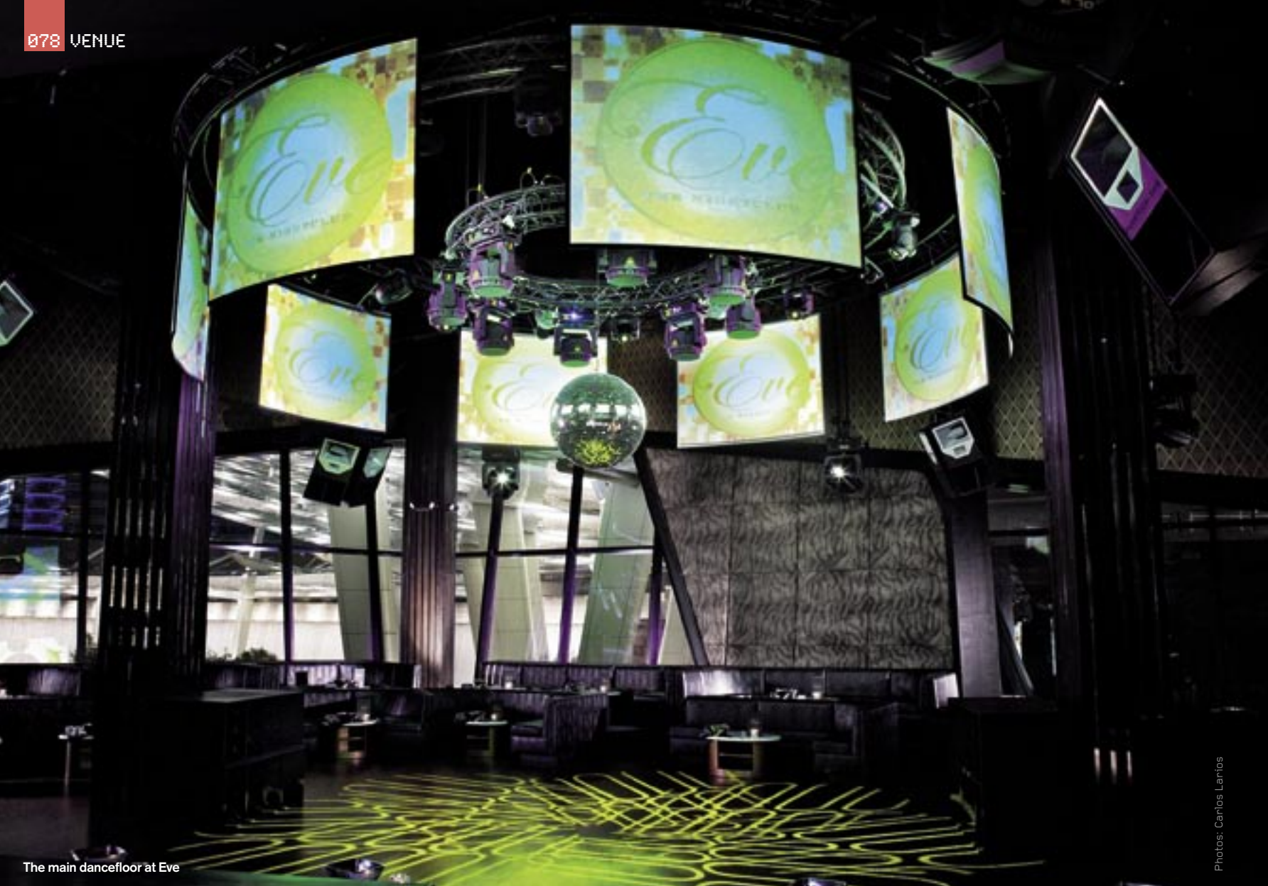
The main dancefloor at Eve