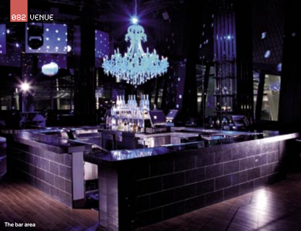
The bar area