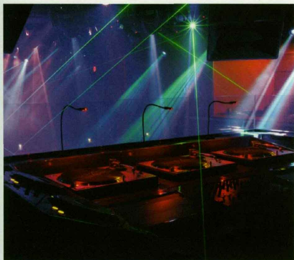
Masque's impressive DJ booth occupies a prime position at the head of the club - allowing the DJ to control the action and atmosphere of the venue with ease. Products from Denon, Rane, Pioneer and Technics all feature

Since its launch in January this year, Masque in Dayton, Ohio has rapidly carved itself a reputation - not just as one of downtown Dayton's top late night entertainment draws, but as one of the best gay night clubs in the U.S.