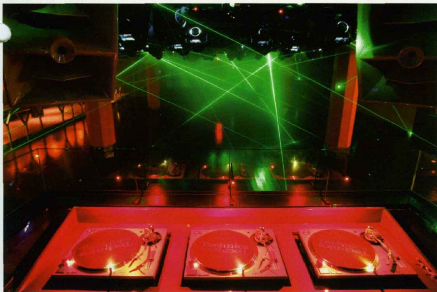
Masque's lighting rig is dominated by products from Martin Professional. MAC 250s, MAC 300s, MX-5 and Wizards are all used to great effect. Chauvet Lazer Scans and Colortubes add further dynamism. Audio comes from a mixture of Funktion One (main system), JBL, FBT, Turbosound, MC2, Crest and XTA