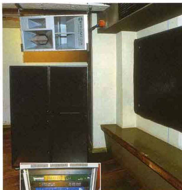
The backroom equipment at Plastic People includes C Audio Pulse amplification and BSS's new Soundweb MkII digital signal processing, used to control Funktion One speakers as well as dedicated controllers for the Nexo PS10s used for peripheral sound

And that's about it. There are no frills about this club. But with change out of £100 for the lighting, the audio boys reckon that Plastic People achieves just about the perfect ratio of sound to lighting.