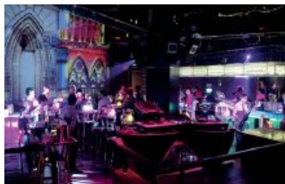
The F1 speakers overlooking the bar and DJ area

'We knew that Funktion One would perfectly match the music here and really fit with its image'