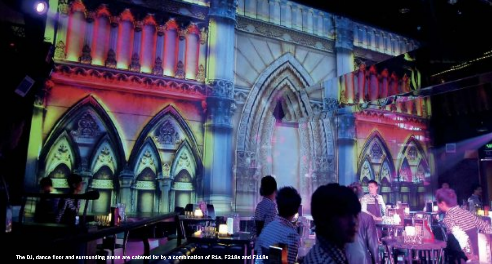
The DJ, dance floor and surrounding areas are catered for by a combination of R1s, F218s and F118s