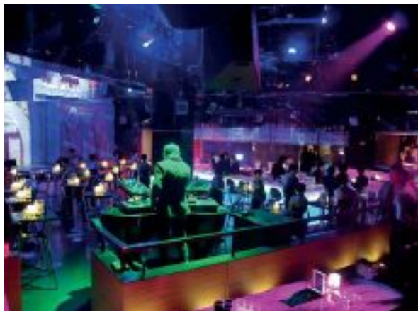
The F1 system is said to 'perfectly match' Falling Club's image

The team set to work installing 12 F101 two-way speakers hung each side of the quiet area, complemented by four F118 18-inch subwoofers. When addressing the DJ and dance floor section, eight R1 two-way cabinets boosted by two F218 subwoofers were installed, whilst the area around this is taken care of by a further 10 R1s, 10 F118 subs and two F218s. Powering the R1s and F101S are 10 E25 power amplifiers, while all subwoofers are driven by a total of five E45 amps. Lastly, two Funktion One XO-4 audio management systems handle speaker control.