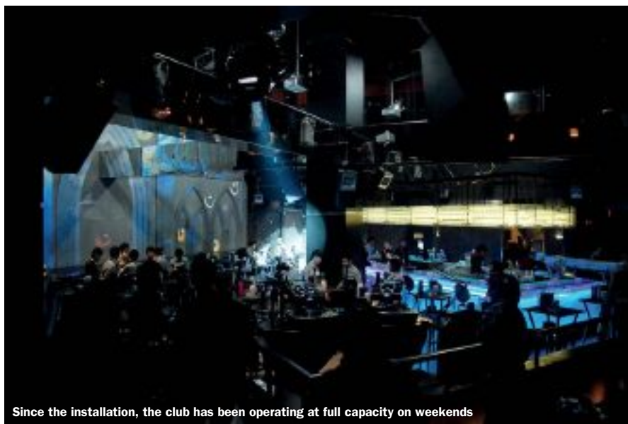
Since the installation, the club has been operating at full capacity on weekends

Setting up an intercom system isn't rocket science... At least it shouldn't be.