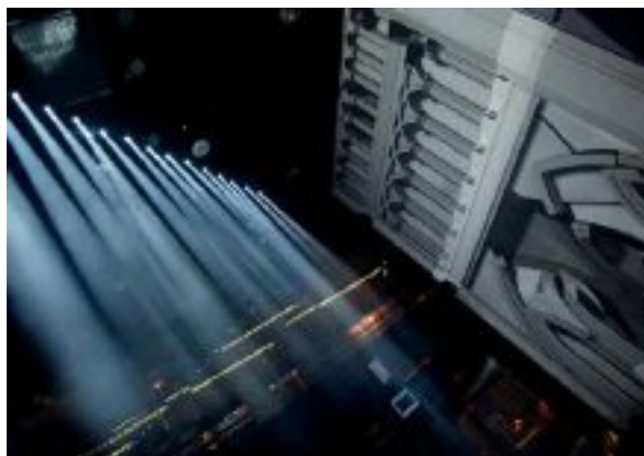
The Funktion One speakers compliment the bar's 3D projection system

'In the past, there has been an underlying rule with regards to the proportion of investment an entertainment venue places on lighting and sound,' says Funktion One China's Bruce Chan. 'It used to be approximately 70 per cent for the lighting system and 30 per cent on the sound system in the 1990s. However, this ratio has changed and now the figures are reversed. Nowadays, entertainment venue owners will invest 70 per cent in a