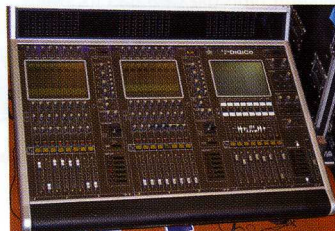
The DiGiCo D1 at FOH

audio installation into the tower to begin with.