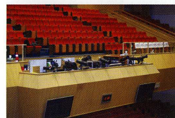
The front of house position

The result was certainly impressive, but then so is Oryun Church itself. Its main sanctuary occupies four entire floors of a 10-storey tower based in the city's Olympic Square district, while its congregation is 10,000-strong. Broadcasts of its services are relayed over four cable television channels as well on the internet, while its message is simultaneously translated into four languages beyond the native Korean: English, Japanese, Chinese and Russian. Even in Seoul, where the streets are thick with believers and the churches are many, Oryun is a remarkable place.