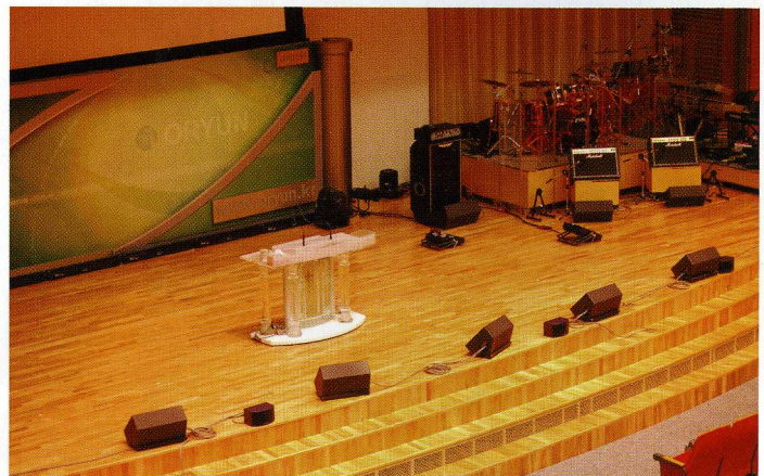
The impressive stage