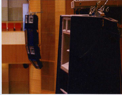
The view from one Funktion One hang to another

While the main Sanctuary is by far the largest and arguably most striking area within Oryun Vision Centre, it may not be the most well known. Nor is it the only room in the tower with a Funktion One system. Situated below it is another hall, described by Mr Kang from Soundus as a famous venue in Seoul for weddings. The