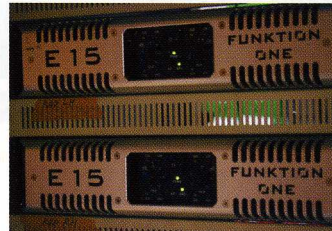
E 15 amplifiers in use

Previously a DiGiCo D5 was used here, though the purchase of the D1 was already planned. It has become the heart of the Sanctuary's