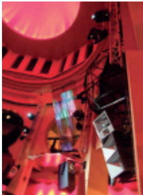
The high ceiling and hollow walls make it a very reverberant space

In the VIP areas and around the perimeter of the dance floor eight F101 speakers have been fitted. Added to this are two Res 1.5 and