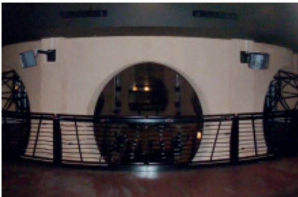
F88 speakers are used to cover the upper levels of the club

two PX 1.5 – the passive crossover for the Res 1.5. In the rack room, power comes from an E30Q and an E25, with an X04 for loudspeaker management.