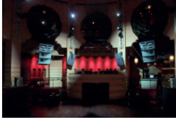
The dance floor covered by the new Funktion One system