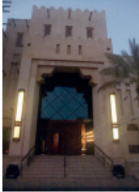
Dubai's Trilogy nightclub

This is high praise indeed for the manufacturer, and an opinion